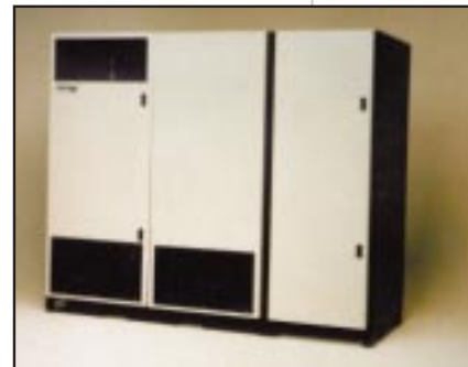
EEC and NaviSite settled on the Powerware System 375.

Today, the Internet is as crucial to business as a telephone is to the average household. The worldwide web serves as your communication path to the world. Now, NaviSite makes it easier to keep up with the high demands of the Internet through their high-end web hosting and Internet application solutions. And with a guarantee of 99.99% availability, there is little to lose.